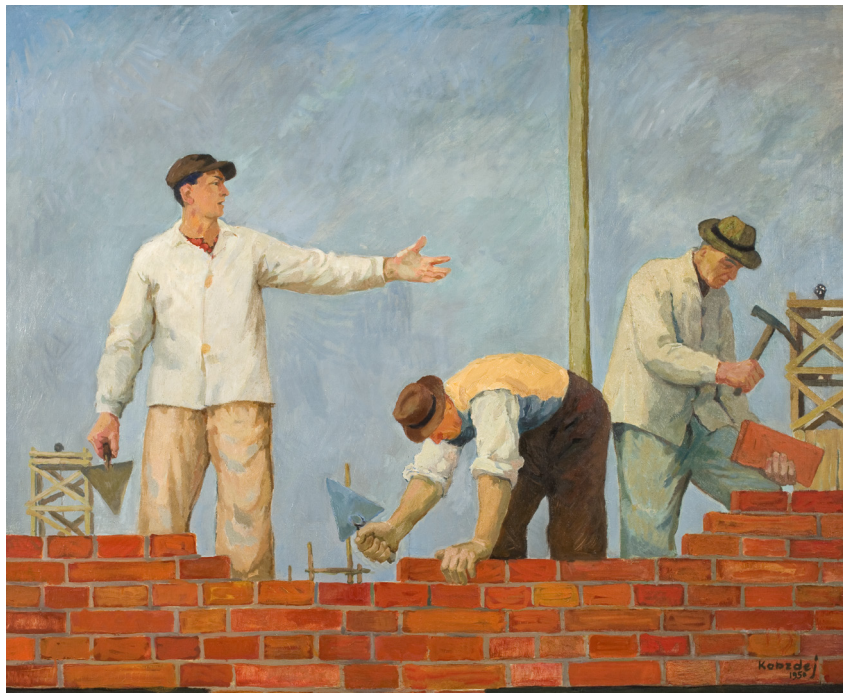
Fig. 1 Aleksander Kobdziej, Podaj cegłę ( Pass Me a Brick ), 1949, oil on canvas, 133 × 162 cm, © The National Museum in Wrocław, 2018.

analyses the application of the colour red in his Socialist-Realist paintings and informel works, in order to uncover the psychological link between the colour red and social fear. Kobdziej's contrasting application of red in his Socialist-Realist painting Podaj cegłę ( Pass Me a Brick , 1949 Fig. 1) and his 'matter painting' cycle Szczeliny ( Crevices , 1966-1968 Fig. 2) provides an example that demonstrates the unique character of Polish art of the 1960s as it relates to the Western neo-Avant-Garde. 6 This article not only analyses the moral dilemmas of artists working immediately after the Stalinist period, but also attempts to offer a sample of research ethics, which may serve as a model for researchers from a range of humanistic disciplines.