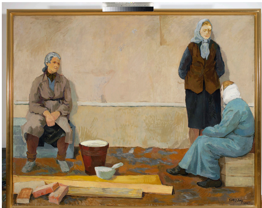
Fig. 3 Aleksander Kobzdej, Ceglarki ( Bricklayers ), 1950, oil on canvass, 133 x 169 cm, © The National Museum in Warsaw, 2018.

While the tradition of the Polish Avant-Garde was passed down to Kobzdej during his education, the tradition of the Western neo-Avant-Garde was acquired by the artist during his travels. Kobzdej's artistic position grew significantly during the Socialist Realist period. 20 At that time he was involved in preparing works to illustrate the slogans of Socialist Realism. Paintings such as Podaj cegłę ( Pass Me a Brick , 1949 Fig. 1) and Ceglarki ( Brick Layers , 1950 Fig. 3) come from this period. Recognition from the state helped him find a place among artists such as Tadeusz Kantor and Jerzy Nowosielski, who were selected by the government to represent the Polish People's Republic on the international art scene.